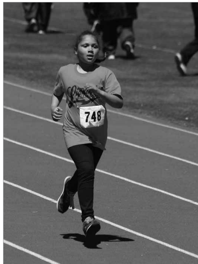
Special Olympics Summer Games

Busing: $12 (Available for in-district residents only, on a first-come basis. Bus pick-up is between 5-6 p.m.)